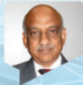
Mr. A. S. Kiran Kumar Chairman ISRO, Secy DOS